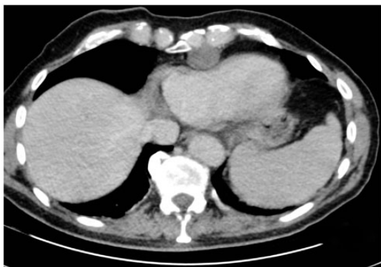
Fig. 1. Second CT scan of the chondrosarcoma. Tumor makes a slight compression of the heart.