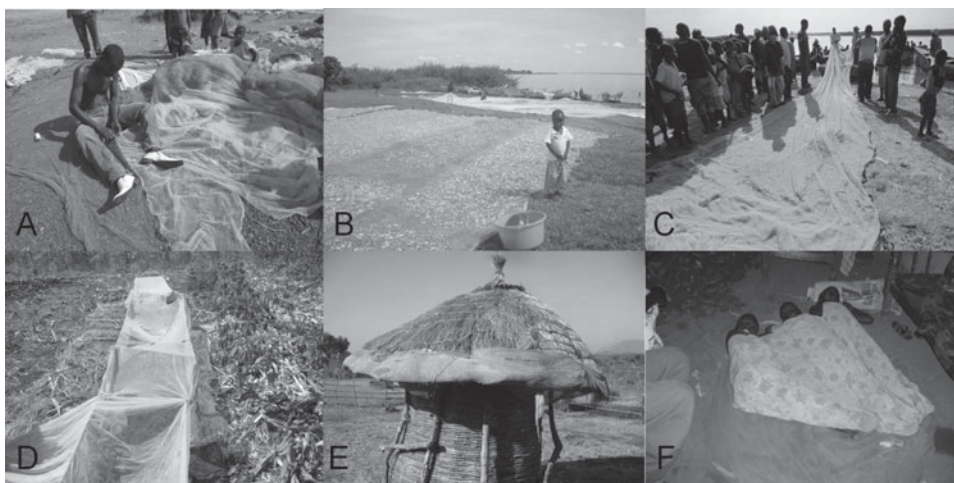
Fig. 1. Examples of alternative ITN uses. (A) Sewing bednets to create larger nets. (B) Drying fish. (C) Fishing. (D) Crop protection. (E) Granary protection. (F) Sleeping mat.