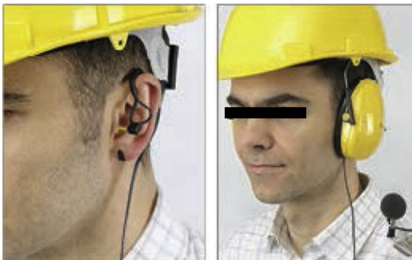
Fig. 2. Schematic setup for measuring noise reduction of the hearing protection devices.

The MIRE can also be performed through two microphones, one placed inside the ear canal underneath a hearing protector, and the other simultaneously placed outside the ear. In this mode, the noise attenuation is the difference between the sound levels