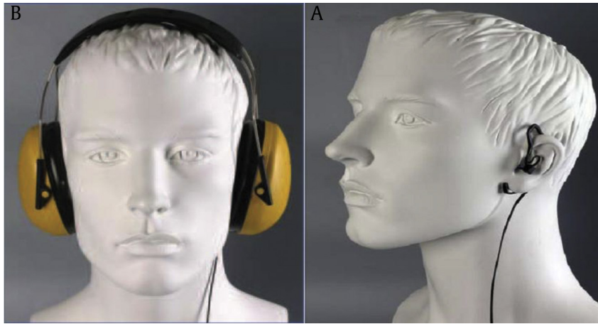
Fig. 1. The schematic setup for measuring insertion loss of the hearing protection devices.

Location of the loudspeaker relative to the individual is another important consideration while obtaining real-ear measurements. Based on the recommendation, the distance between the loudspeaker and the worker was chosen as 1.0 m. The artificial omnidirectional sound source with 12 matched loudspeakers and remarkable output power of 115 dB (developed by BSWA Technology Co. Ltd. Beijing 100029, China) was used. The test signal was continuous pink noise with a sound pressure level of 90 dB ( \pm 1 dB) at the listener's hearing zone. The data were acquired using a dual-channel acoustic dosimeter in a short time of about 60 seconds for any fit test on each ear to obtain data at seven standard test frequencies from 125 Hz to 8 kHz. It should be noted that each worker wore five HPDs, and therefore, five time measurements were performed based on the MIRE technique for each worker. Moreover, the actual attenuations of the earmuffs along with wearing a typical safety eyewear (with medium frame, 3 mm) were also measured. It should be mentioned that five workers were employed to participate in this part of experiments.