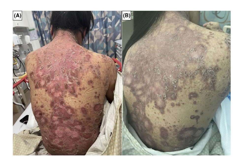
FIGURE 1 Shows the skin eruption. (A) before and (B) after treatment after cyclosporine

Two days after testing positive for SARS-CoV-2, she noticed a painful scaly rash that progressed to involve most of her skin (Figure 1). The rash was a widespread painful, itchy erythematous skin rash with significant scaling that mainly affects the trunk, the back, upper limbs, and scalp. The rash spares her face, palms, and soles. She first noticed a painless scattered slightly scaly rash with nail changes 6 months ago( Figure 2), which she did not seek medical attention. The lesions were stable until the presentation when she noticed a rapid progression of the rash. There were no associated joint pain or swelling; she has no family history of similar