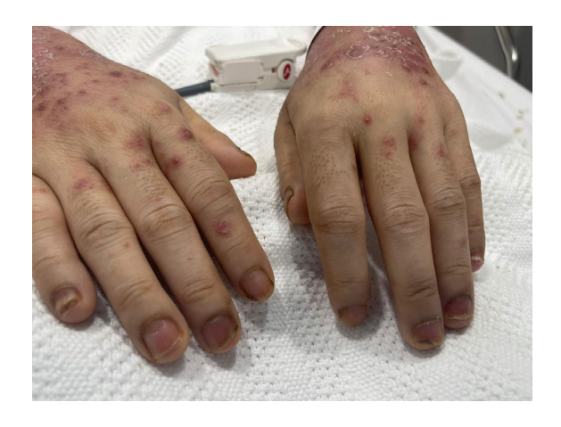
FIGURE 2 Showed nail pitting

She was admitted for 5 days during she received generous IV hydration and started on oral Cyclosporine 100 mg twice daily therapy (after SARS-CoV-2 was negative), along with oral minocycline, topical mometasone 1% cream with emollients. The renal function was stable. Her skin rash improved significantly, and she was discharged on cyclosporine and mometasone cream with dermatology follow-up.