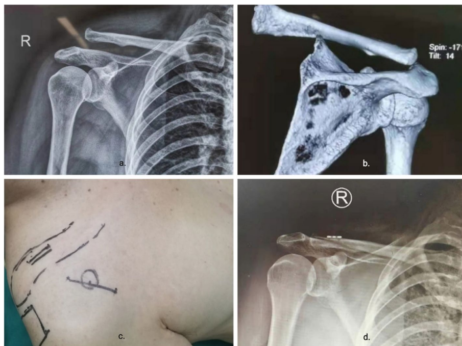
Fig. 3 Introduction to the perioperative period. a, b Pre-operative X-ray and CT evaluation and measurement of acromioclavicular joint dislocation. c Primary body surface location and marking by imaging and anatomical position. d Postoperative imaging assessment of reduction

six were left-sided and ten were right-sided. The mechanism of injury was traffic injury in 9 cases, direct violence in 1 case and a fall in 6 cases. The patient's BMI was 23.77 \pm 3.03 (range 18.1–28.6); the anesthesia record sheet showed operation time was 62.5 \pm 12.4 min, (range 50–90 min); intraoperative bleeding was 55.0 \pm 17.1 ml (range 30–100) ml. The patient's time in the hospital was 5.8 \pm 0.8 days (5–7d). (Tables 1 and 2).