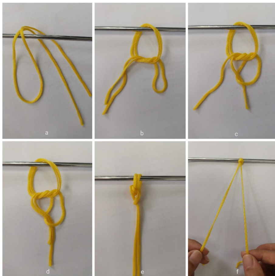
Fig. 1 Nice Knot technique. a A double-over suture is passed around the tissue. b A single square knot is thrown. c, d The 1/2 free limbs are passed through the loop. e The knot is dressed. f The knot is slid down by pulling the 2 free limbs apart and the tightened knot is ready to be secured with 3 alternating half-hitches or a surgeon's knot

the coracoid to reveal the coracoid process conjunctive tendon and coracoid root. The injured limb is internally rotated in the inward position, and a traction wire is placed along the base of the coracoid from inward to outward around the coracoid and into a reserve. Bone channels of 2mm each drilled 1.5cm and 3cm distal to the acromioclavicular joint and 2cm anterior to the posterior border of the clavicle. The traction wire is placed in the bone channel and reserved for use. The double-endobutton is split and keep only the single-endobutton. The two strands of endobutton suture are folded into four strands and introduced through the medial hole of the clavicle, around the rostral process and leading out at the lateral hole of the clavicle, respectively out of the hole of endobutton. The acromioclavicular joint is repositioned and fixed on the endobutton using the nice knot and gradually tightened. Intraoperatively, the acromioclavicular joint was observed with C-arm fluoroscopy. If the joint was