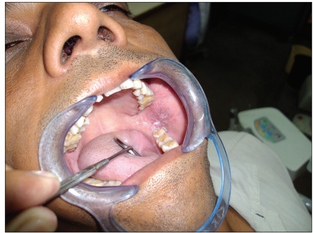
Figure 2: After 4 week treatment