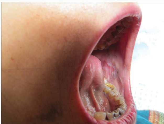
Figure 5: Pre treatment showing lesion

Turmeric is the dried rhizome of the perennial herb Curcuma longa . It is called Haldi in Hindi, turmeric in English, ukon in Japanese. It has been used in Asian Medicine since the second millennium BC. Its utility is referred to in the ancient Hindu script the Ayurveda.