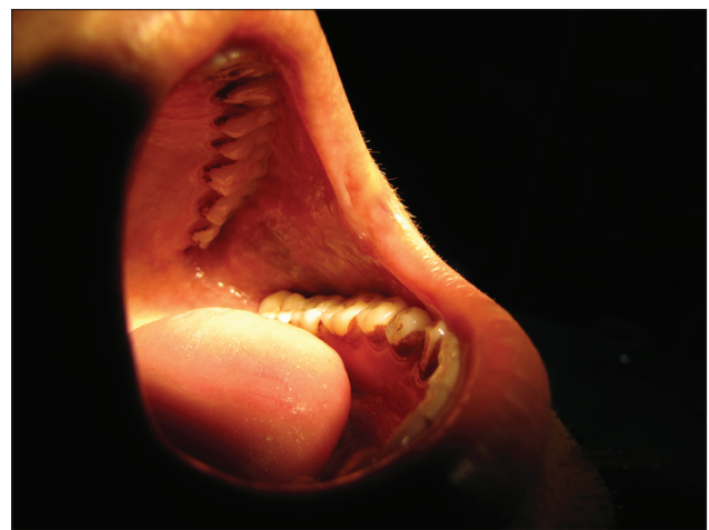
Figure 4: Case 2 after 1 month treatment