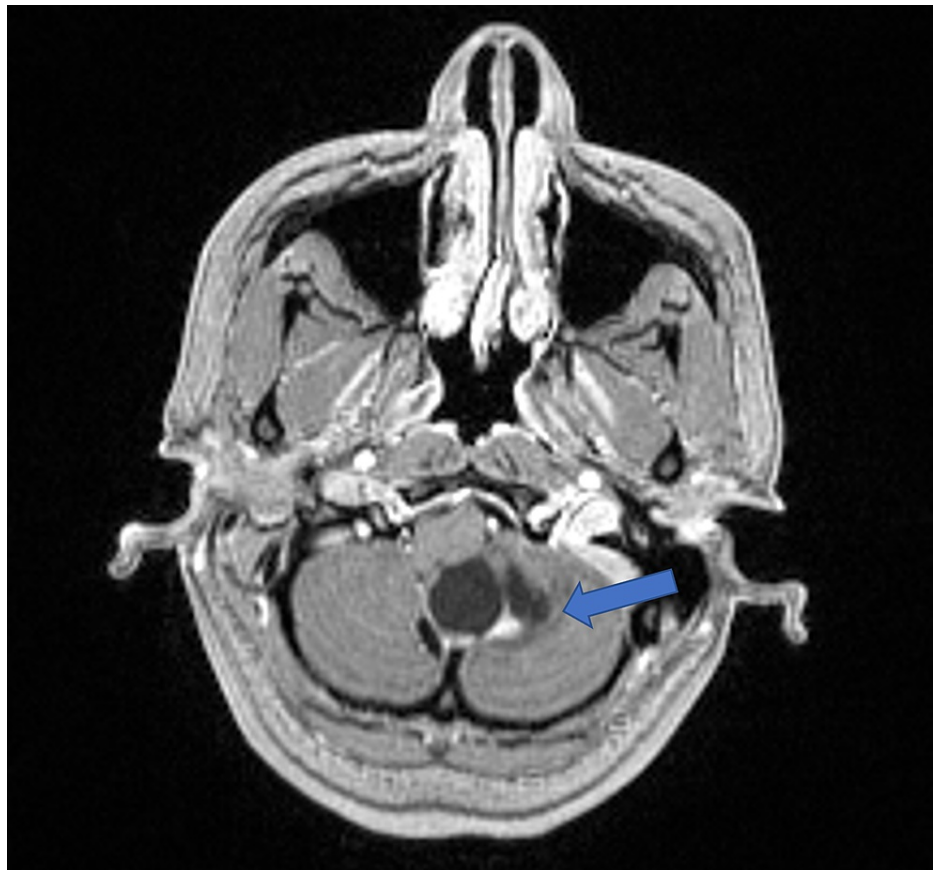
FIGURE 3: Axial T1 MRI with contrast

Six mm solid enhancing component in the inferior aspect of the lesion (blue arrow)