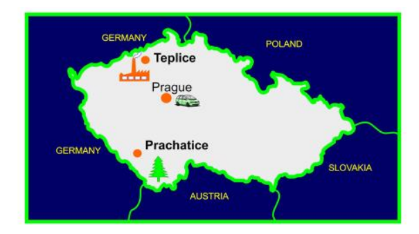
Figure 1. Map of the Czech Republic with the locations of studied districts.

The health consequences of environmental pollution became one of the major concerns of the Czech government after political changes in 1989. At the end of 1990, the government put forward an interdisciplinary project later called the Teplice Program in order to analyze the impact of air pollution on human health in the mining districts [5]. The mining district of Teplice in Northern Bohemia was used as the polluted district for this program. The district of Prachatice in Southern Bohemia had some of the cleanest air in the Czech Republic and was used as the control district (Figure 1). The distance between those two districts is 240 km. The Teplice district had 127,500 inhabitants and an area of 469 km², of which a large part had been devastated by the strip-mining of coal and associated industrialization. The district of Prachatice had 51,500 inhabitants and an area of 1375 km², of which 52% was woodlands. In 1993, the average PM10 concentrations in Teplice were 76 vs. 38 \mu g/m³ in Prachatice. Similarly, PM2.5 concentrations were 64 vs. 32 \mu g/m³, respectively, and benzo[a]pyrene (B[a]P) 3.7 vs. 2.5 \mu g/m³ [6,7].