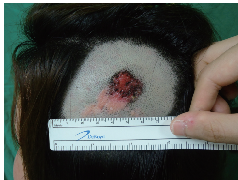
Fig. 1. Preoperative appearance. A papillary erythematous mass arose within a yellowish verrucous nevus sebaceous on the left parietal scalp.

Malignant trichoblastoma is a rare malignant adnexal tumor originating from the hair germ cells. Malignant changes in trichoblastoma may be related to its epithelial component (trichoblastic carcinoma), stromal component (trichoblastic sarcoma), or both (trichoblastic carcinosarcoma). Trichoblastic carcinoma usually presents on the scalp and face in