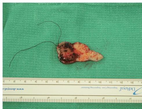
Fig. 2. A 4.7 × 1.8 × 0.4-cm oval, elevated lesion is seen, with an area of focal black pigmentation measuring 1.4 × 1.5 cm.