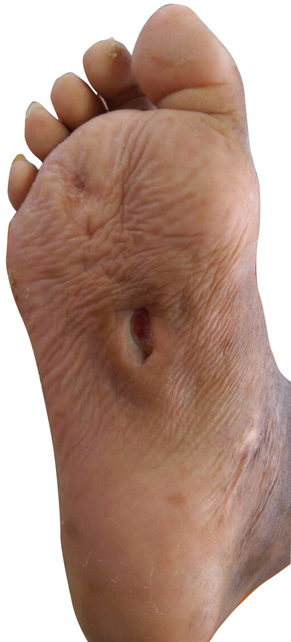
Figure 1 An ulcerated wound on the sole of right foot, measuring 5×4 cm.

Antibiotic susceptibility test of B. pseudomallei was done in a biological safety cabinet, by disk diffusion method on