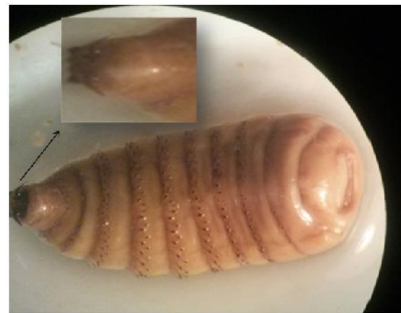
Fig. 2. Gasterophilus intestinalis collected from the stomach of a lion