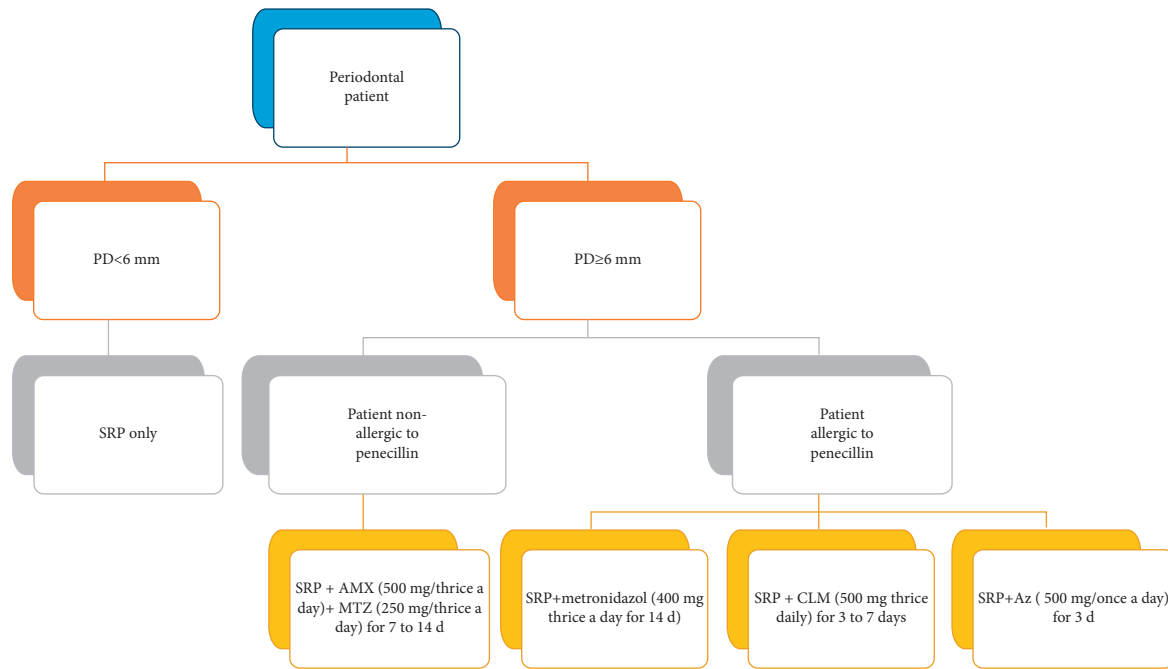
FIGURE 2: Summary of different effective suggested protocols.

compared to the placebo group. For Suryaprasanna [15], this significant difference between test and control groups was observed until the 3 rd month but not significant ( p = 0.774 ) at 6 months after initial therapy.