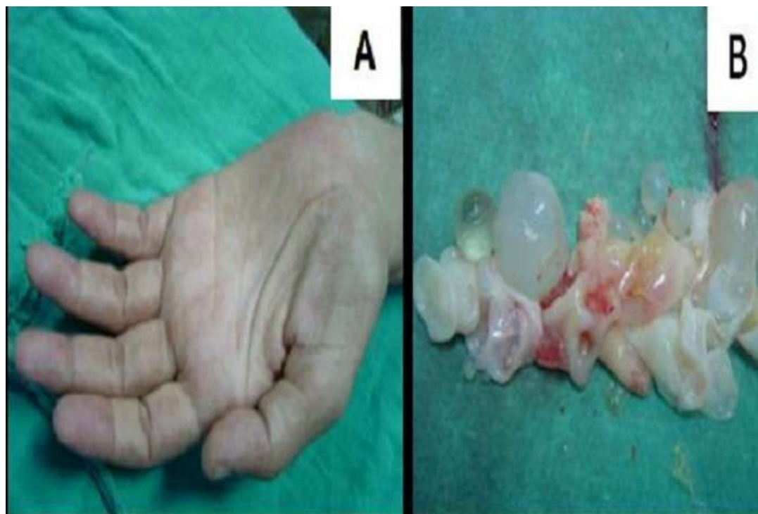
Figure 1: A: Our patient's left hand showing an atrophy of thenar and hypothenar muscles; B: some hydatid cysts which have been removed