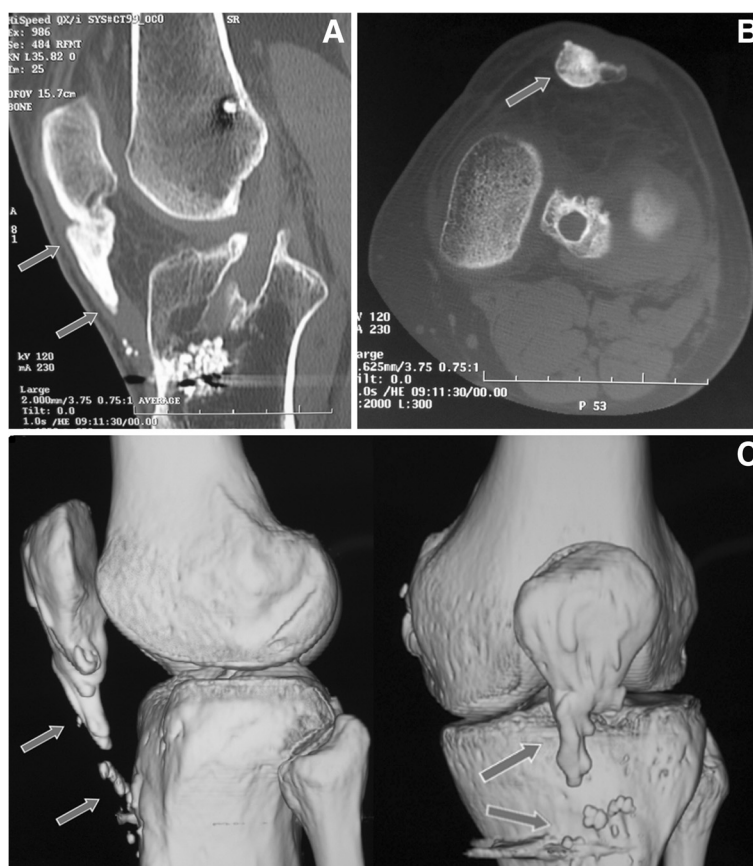
Figure 1 Computed Tomography (CT) scan image of the patient's left knee at the time of presentation. (A) Sagittal CT scan image shows a 2.8 × 1.2 cm conical ossification of the proximal patellar tendon (arrows). It is present hyperdense material within the tibial tunnel attributable to a resorbable screw. (B) Transverse CT scan image at the joint space level shows patellar tendon ossification (1.5 × 1.2 cm) at the patellar tip (arrows). (C) CT 3D reconstruction images show the proximal and the distal patellar tendon ossification morphology (arrows).

distal portion of the patellar tendon, well represented in the 3D reconstructions (Figure 1C). A comprehensive metabolic panel (glucose, lipids, albumin, total proteins, creatinine, blood urea nitrogen, alanine amino transferase, aspartate amino transferase, alkaline phosphatase, bilirubin, sodium, potassium, chloride and calcium) was performed to exclude metabolic diseases and the result of all tests was within normal ranges. Our hypothesis was that the ossification was the consequence of the persistence of bone fragments inside the patellar tendon after the closure of the soft tissues. Unfortunately, the patient had not any post-operative radiographs to prove this hypothesis. Two months after the diagnosis of ossification of the patellar tendon, an open surgical treatment was performed to remove the proximal and distal lesions (Figure 2A, B). Two masses of bone texture, localized at the patellar apex and at the distal portion of the tendon, inside the tendon sheath and surrounded by tendon's fibers, were removed. A rigid orthosis locked in extension was applied and an anti-inflammatory therapy with ibuprofen (200 mg twice a day for a week) was performed.