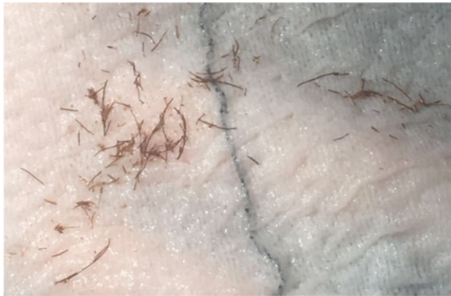
FIG. 2. Extracted fragments after lasertripsy.

a mild urinary incontinence. The histopathology examination confirmed a benign prostatic hyperplasia with chronic inflammation (Fig. 3B). The patient was seen in our office 10 days after the treatment, and then at 1 and 6 months. At the last follow-up, the patient was free from the catheter, he reported a good subjective satisfaction with an improvement of incontinence (maximum 1 pad/day). Urine culture was negative and uroflow was normal, without postvoid residual.