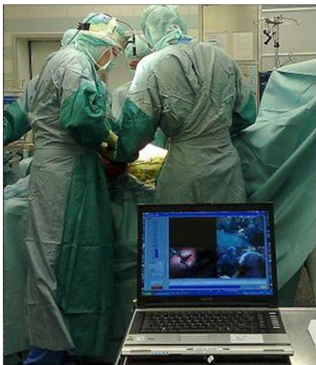
Figure 1 Setup in the Operating Theater.

rate as possible, almost every recorded action can be defined. This way of grouping separate actions into GOA's was chosen, since it would not have been feasible or efficient to separately score every action seen in a 90 minute film. Eventually the operative procedure is divided in Goal Oriented Phases (GOP);