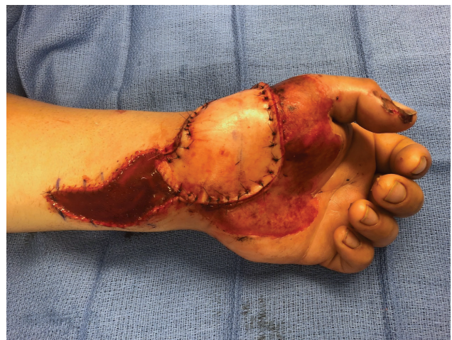
Fig. 3. Flap inset to the palm after anastomosis to the ulnar vessels and nerve coaptation from the palmar cutaneous branch of the median nerve into the medial plantar sensory nerve of the flap.