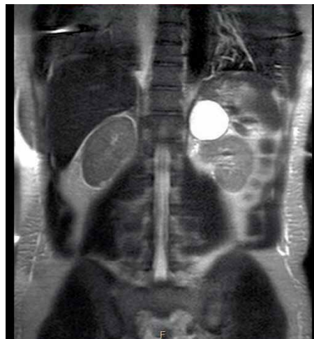
FIGURE 2: MRI abdomen demonstrating left adrenal mass.

Pheochromocytoma is a rare catecholamine secreting tumor, occurring in less than 0.5% of patients with hypertension [4],