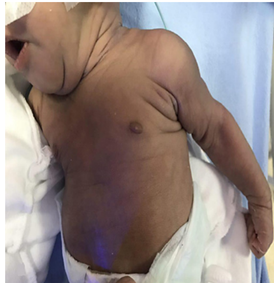
Fig. 2. Photograph of the patient at the age of 1 month showing resolution of ichthyosis.

due to aspiration of skin debris that shed into amniotic fluid [5]. Antenatal ultrasound may show separation of chorionic and amniotic membranes and polyhydramnios with starry sky appearance [4, 5]. Histopathology of skin is pathognomonic with acanthosis, hyperkeratosis, and characteristic aggregates of curved lamellar structures in the perinuclear cytosol of the stratum corneum and stratum granulosum [6]. Perivascular inflammation with eosinophilia was seen in some cases [6].