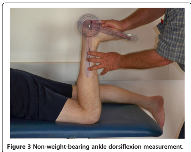
Figure 3 Non-weight-bearing ankle dorsiflexion measurement.

Overall, 5 participants were diagnosed with AT during ABT. All injuries occurred in the right leg. Ankle DF as measured in NWB was more limited among participants that developed AT ( p = 0.025 ). Univariate logistic regression also indicated that NWB ankle DF ROM significantly predicted AT ( p = 0.007 ). The unit odds ratio (OR) for NWB DF in predicting AT was 0.77 (95% CI 0.59 – 0.94) which indicates, that for every 1-degree of increased NWB DF ROM, the odds of developing a future AT reduced by 0.23. The ROC curve for NWB DF