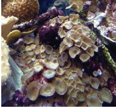
FIGURE 1: Coral similar to that encountered by the patient.

Acetaminophen was given for the fever with improvement of temperature to 100.8°F. Nebulized albuterol was given for the dyspnea and wheezing, with minimal improvement of symptoms. A portable chest X-ray was obtained and was normal. An EKG showed sinus tachycardia. Lab findings were significant for leukocytosis of 14,000, and an influenza swab was negative for influenza A and influenza B, and cardiac troponin I and brain natriuretic peptide (BNP) were normal.