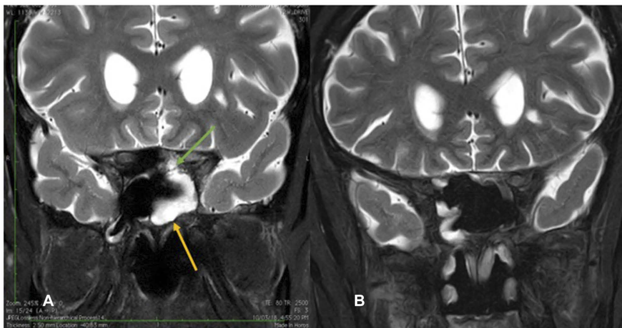
Figure 4 (A) MRI orbit T2 weighted image (coronal section) shows a hyperintense lesion extending from the left sphenoid sinus (yellow arrow) into the left orbital apex compressing the optic nerve (green arrow). (B) MRI orbit T2 weighted image (coronal section) of the same patient post sphenoid sinus and optic nerve decompression.

Patients present with unilateral vesicular eruptions, vision loss, ophthalmoplegia and anisocoria along with signs of keratouveitis. Typically, ocular manifestations start 1–4 weeks after skin lesions. Treatment includes antivirals. The use of steroids as an add-on therapy is still controversial.