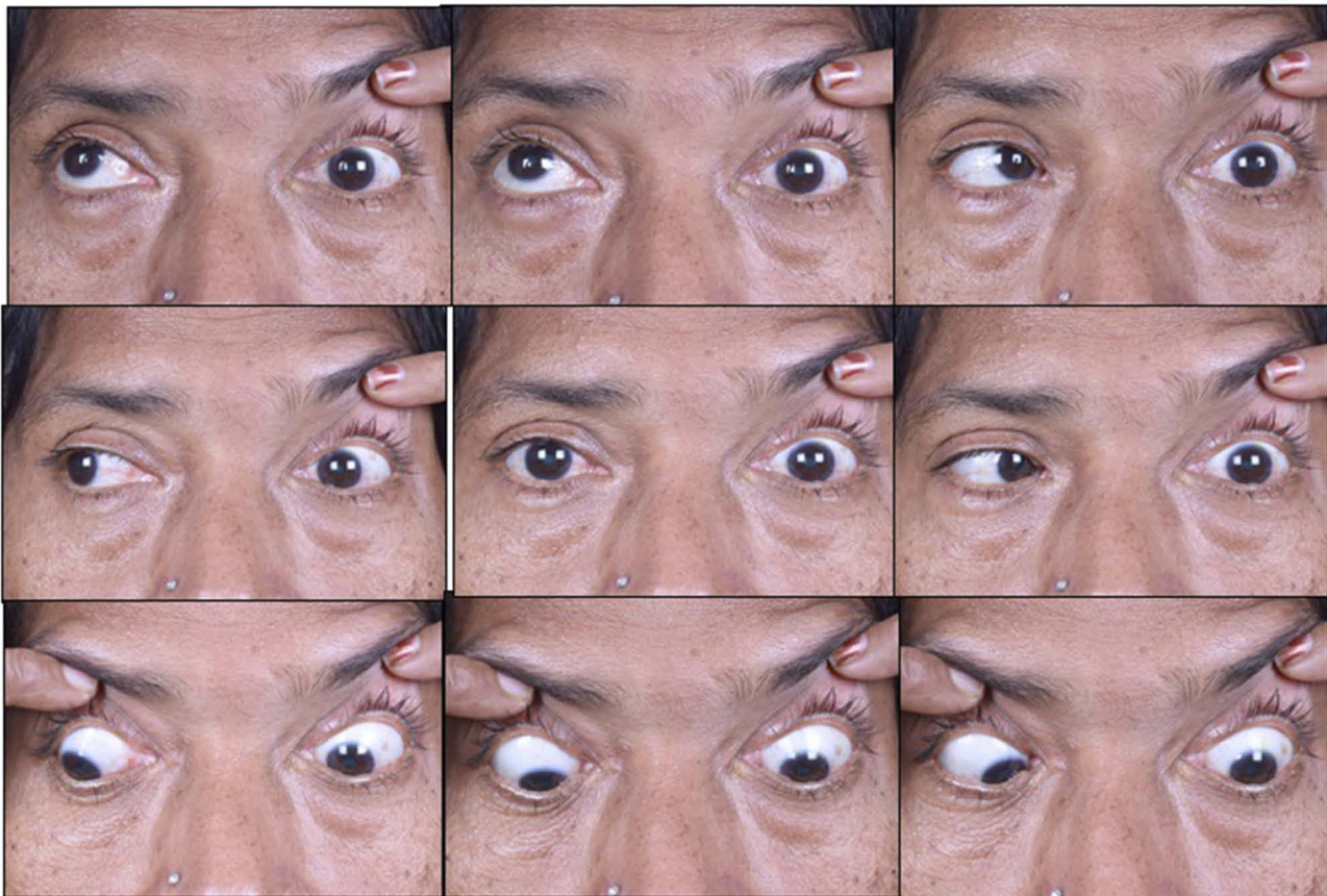
Figure 2 Nine gaze photo of a patient with orbital apex syndrome showing limitation of motility in all gazes in the left eye. This patient underwent a complete blood count and distribution, cerebrospinal fluid examination for cytology and microbiological work up, Mantoux test and serum ACE levels along with an MRI Brain and orbits with contrast. Since all the blood investigations were normal, she was diagnosed as Tolosa Hunt Syndrome.

Patients with IgG4-ROD can have systemic involvement in the form of enlarged salivary glands, lymphadenopathy, hydronephrosis due to retroperitoneal fibrosis, auto-immune pancreatitis as well as pulmonary disease. A complete