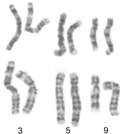
Figure 1 - Partial G-banded karyotypes of the familial rea(3;5;9)(p24.3;p13.1p15.2;q22) . Upper row: the child's unbalanced karyotype, with only the 5 and 9 derivatives; the patient had a duplication of 3p24.3→pter concomitant with a deletion of 5p15.2→pter. Lower row: the mother's balanced karyotype, with all three derivatives. Except for the patient's normal pair 3, the derivative is on the right in each pair.

Because the 5p segment can be regarded as "inserted" into the der(9), our observation may support the contention that complex chromosome rearrangements (CCR) with at least one insertional translocation can be transmitted either paternally or maternally and are refractory to recombination