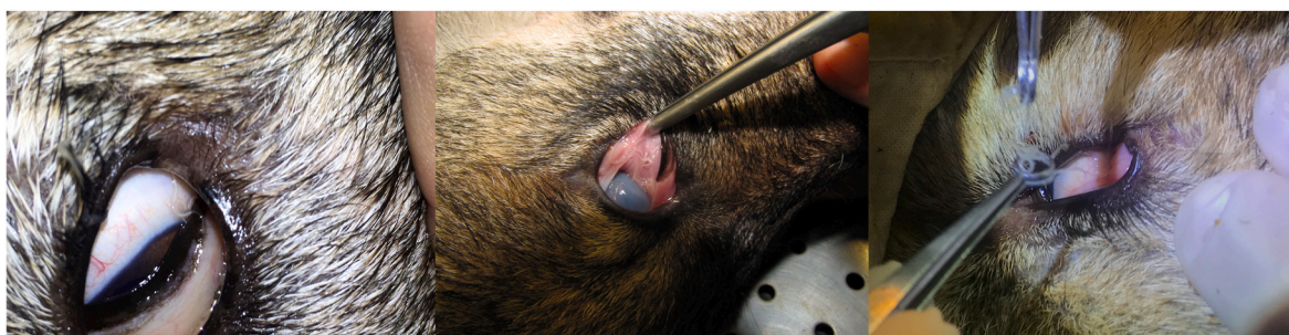
Fig. 1. Presence of Thelazia callipaeda in the conjunctival sacs of wolves ( Canis lupus ) from the Italian Alps.