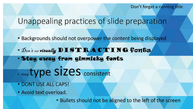
Fig. 4 Slide formatting: Poor practices of slide formatting.

or wavy fonts as they may be distracting. Let the font type and size be consistent throughout the presentation. Ensure that there are not more than four to five lines on a slide. Matter should be presented in points and not paragraphs. Bullet points or numbering may be used. Ensure that bullets are aligned to the left of the screen as they are easier to read. Highlight using a separate color or animation, the most important part of these points. The audience can be kept on their feet by creating suspense using nondistractive progressive transitions. Avoid using sounds during transitions. ► Figs. 3 and 4 show the examples of the do and don'ts of slide formatting, respectively.