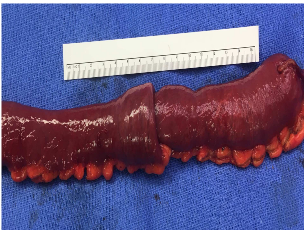
Figure 3: Gross resection specimen.

We report a 32-year-old man who presented with acute on chronic abdominal pain with cross sectional imaging that identified jejunal intussusception. This was confirmed in operating room and resected, however no pathologic lead point was identified on pathologic review.