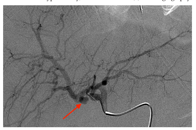
Figure 2. DSA with injection from proper hepatic artery confirming a round-shaped pseudoaneurysm of the cystic artery, just laterally to the surgical clip (red arrow).