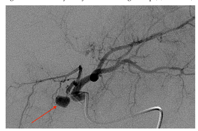
Figure 3. Selective catheterization of left hepatic artery showing the cystic artery presents an unusual origin from the very proximal left hepatic artery. The pseudoaneurysm is clearly detectable (red arrow).