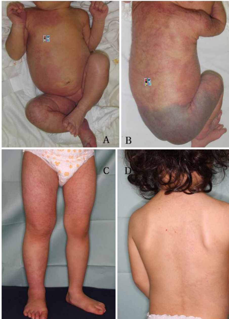
Figure 1 Case 1: A baby with phacomatosis pigmentovascularis type IIb treated with combination laser therapy. (A, B) The baby had a port-wine stain on her right side, hemihypertrophy of her legs, and cutis marmorata telangiectatica congenita (CMTC) on her back and legs. (C, D) In photographs taken after five sessions of laser therapy, the aberrant Mongolian spots showed improvement, but the CMTC remained mostly unchanged. The CMTC on the child's back showed improvement without laser therapy.

started when the patient was one-year-old. We used a QAL (ALEXLASER; Candela Corporation, Wayland, MA, USA) with an energy density of 6.0\text{J}/\text{cm}^2 to treat the dermal melanosis of her buttocks and thighs. An LPDL (Vbeam®; Candela Corporation) with an energy density of 10\text{J}/\text{cm}^2 and 1.5ms was used simultaneously to treat the PWS and CMTC lesions. Where the lesions were intermingled, we treated the dermal melanosis before the PWS