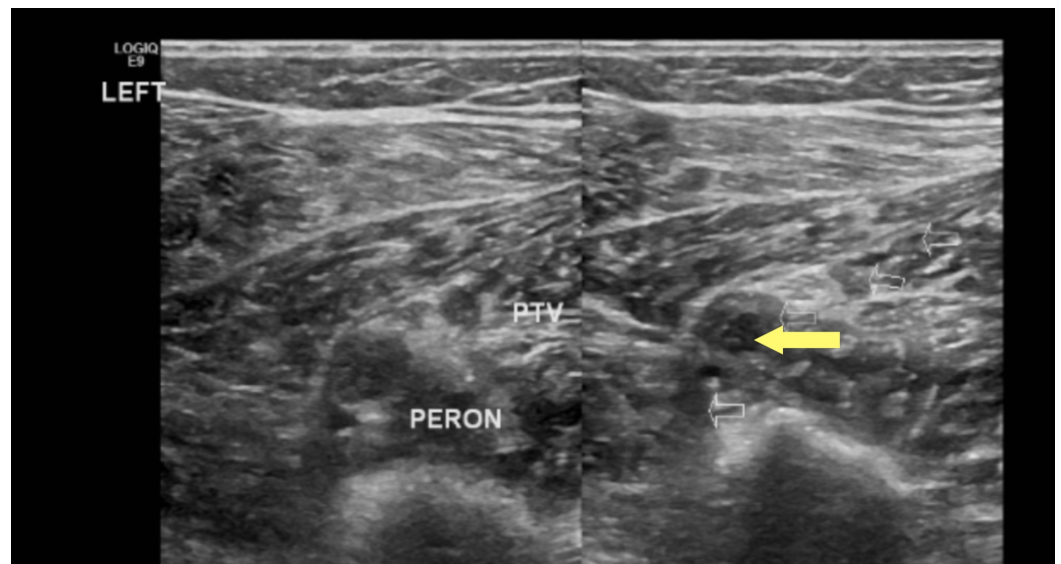
FIGURE 1: Left peroneal vein deep vein thrombosis (yellow arrow), axial view