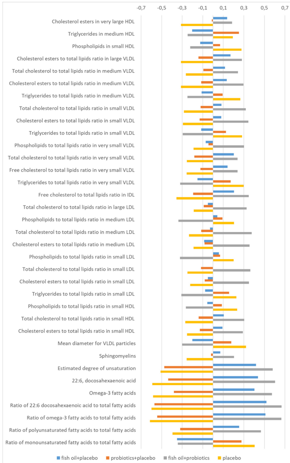
Fig. 2. Metabolites ( n = 35 ) with statistically significant differences in the changes between the fish oil+probiotics group and the placebo+placebo group. The figure shows the effect size of the variables when compared to each other. The lines represent normal scores obtained from rank-based inverse normal transformation by Blom's method. The mean of each variable is zero and thus a negative value indicates a change that is smaller than the mean change.