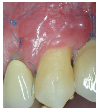
FIGURE 12: Healing of the flap after 15 days, at sutures removal.

but in a simpler and possible more biological manner. Traditionally, the graft is sutured to the split thickness anatomical papillae or the adjacent recipient split area. Ideally, even if it is well positioned on the root, the graft is not very attached to the exposed root but just stretched on it. The fibrin-fibronectin human glue used have demonstrated to allow a real biological, chemical, and physical attachment with the collagen present in the dentin tubules, consequently improving the stability of the coagulum [23]. In addition, bonding the graft is much easier than suturing it. Thanks to these