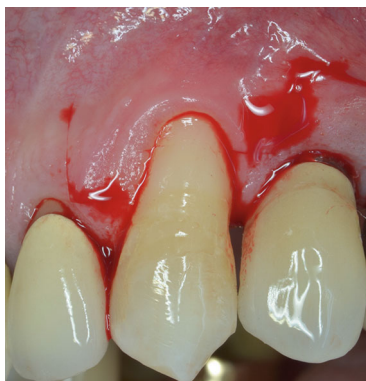
FIGURE 5: A trapezoidal flap is designed with vertical releasing incisions arriving just at the mucogingival junction.