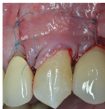
FIGURE 11: The flap has been coronally advanced and sutured.

In this 3-year follow-up, we have noticed a proper tissue's augmentation, together with the reestablishment of the natural emergency profile of the affected tooth crown, similar to the goals usually obtained with the conventional technique,