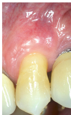
FIGURE 15: 3-year buccal view (note the stability of the gingival margin, the partial root coverage achieved and the aesthetic blending of the area).

aspects, graft could have reduced dimension; it was 4 mm in height, and as reported in literature, there is no need to harvest graft covering the apical bone crest or all the radicular exposure in such a case [17]. In fact, in the original described technique, graft covering adjacent bone areas acted as an obstacle form blood supply between the flap and the recipient bed. This aspect could sometimes influence to early graft exposure and to obtain not appropriate aesthetic results