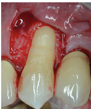
FIGURE 7: Root surface is treated with currettes and anatomical papillae deepithelialized.

into the sulcus, a full thickness central flap was elevated, exposing 3 mm of bone crest, apically to the anatomical root dehiscence. With a Gracey's minicurette root, the surface apical to the MRC was gently treated, removing the contaminated cementum. Then, a first deep horizontal releasing incision with the blade parallel to the bone crest was performed. After a second, more extended superficial horizontal incision was performed with the blade parallel to the oral