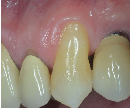
FIGURE 1: Left maxillary canine presenting a RT2 gingival defect.