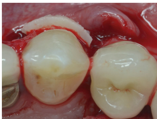
FIGURE 10: Note the thickness of the CTG bonded to the root.

between the graft's connective tissue and the connective fibres in the dentin tubules. The proposed natural healing could determine the soft tissue thickness augmentation as well as the root coverage maintenance.