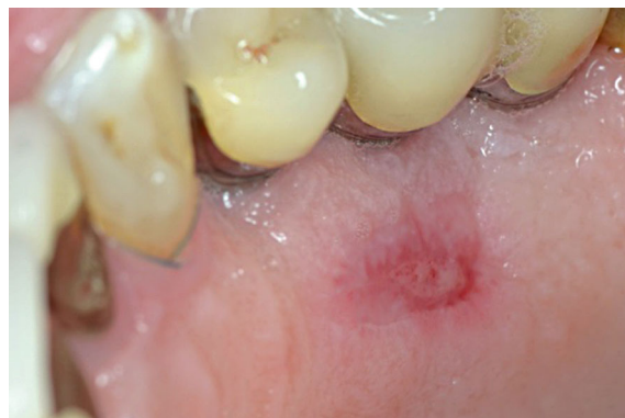
FIGURE 13: Palatal donor site healing after 15 days.