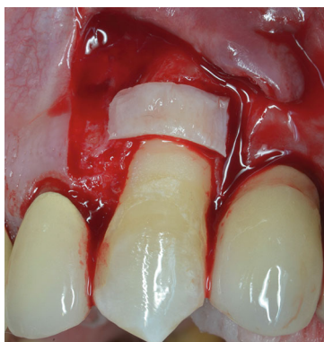
FIGURE 9: The connective tissue graft is attached with the fibrin-fibronectin glue to the root at the MRC level.