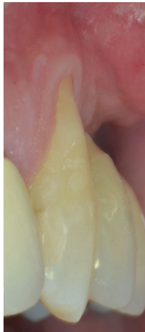
FIGURE 2: Lateral view: noncarious cervical lesion with composite restoration is evident (note the radicular concavity).

fibrin-fibronectin system. Over a follow-up period of 3 years, this technique has demonstrated to be effective in reaching a good root coverage, a marginal soft tissue stability and an increased connective volume.