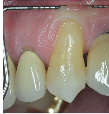
FIGURE 3: A minimum amount of keratinized tissue apical to the recession is still present.

A 53-year-old male, not smoker, presenting a recession type 2 (RT2) gingival defect [18] in correspondence of the maxillary left canine, was referred for a periodontal evaluation (Figures 1 and 2). His main complaint was tooth hypersensitivity and scar of losing all the gingival support. He did not present any medical contraindication for periodontal surgery. The treatment plane was aimed at partial root coverage and marginal soft tissue augmentation. After signing a tailored written consent, he firstly received a nonsurgical periodontal therapy, including oral hygiene instructions and supra- and subgingival scaling, by an experienced dental hygienist. Patient was also instructed about oral hygiene maintenance at home; instructions included modified Bass technique with soft brushes, in order not to damage soft marginal tissue. At 1-month control, the full-mouth bleeding score (FMBS) and the full-mouth plaque score (FMPS) indexes were both \leq 25\% .