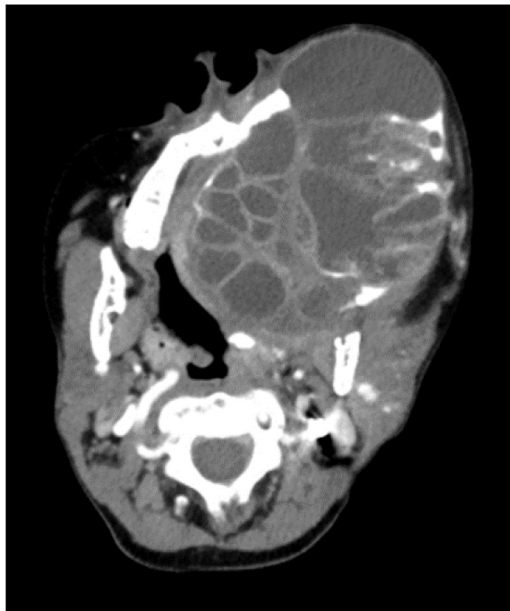
Fig. 2. Maxillofacial CT showing a multilocular lesion in the left superior maxilla.

patterns – microcystic, solid, areas with peripheral palisade and inverted polarity – closely resembling ameloblastoma [Fig. 4b]. Areas of keratinization, islands of ghost cells and broad bands that meet criteria for odontin-like material were also observed. It had focal increased mitotic activity, without other characteristics that suggested malignancy. The cells variable expressed CK19 and CD56, with a basal staining for p63 and CK7 was observed. All the aspects supported the hypothesis of an odontogenic tumor without malignancy criteria, later confirmed in a reference center to be a DGCT.