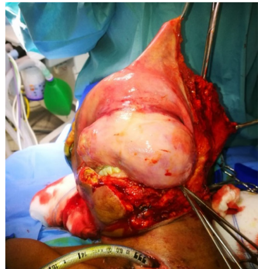
Fig. 3. Intraoperative site, exposing a bone-like lesion invading the mucosa.

patterns – microcystic, solid, areas with peripheral palisade and inverted polarity – closely resembling ameloblastoma [Fig. 4b]. Areas of keratinization, islands of ghost cells and broad bands that meet criteria for odontin-like material were also observed. It had focal increased mitotic activity, without other characteristics that suggested malignancy. The cells variable expressed CK19 and CD56, with a basal staining for p63 and CK7 was observed. All the aspects supported the hypothesis of an odontogenic tumor without malignancy criteria, later confirmed in a reference center to be a DGCT.