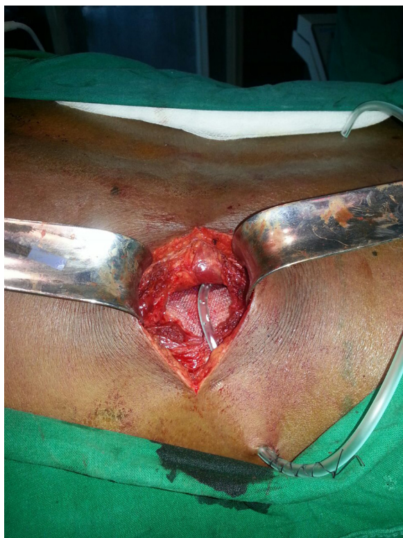
Image 2. Sublay mesh in place.