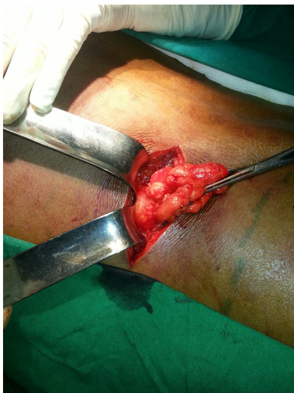
Image 1. Defects noted in the superior triangle with retroperitoneal fat as content.