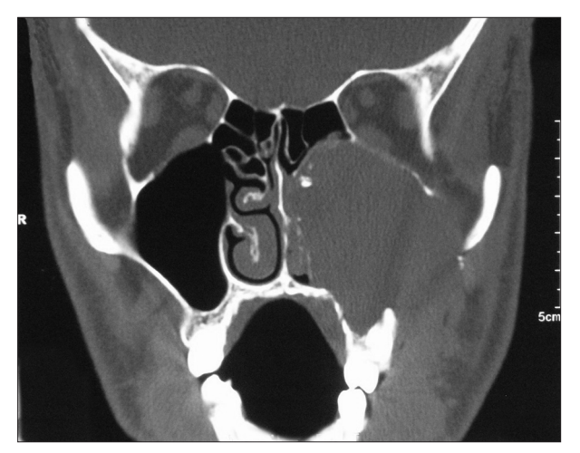
Figure 2: Computed tomography scan shows extensive destruction of the left maxillary sinus

our case, destructive behavior of the lesion was obvious in both conventional radiographs and computed tomography images. Failure to correctly evaluate the panoramic radiographs and establish a clinical differential diagnosis by the general practitioner should be given special attention. This led to unnecessary extraction of the teeth and delayed diagnosis of the