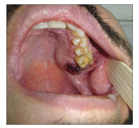
Figure 1: Intraoral view shows buccal and palatal expansion in the left maxillary region and the exophytic ulcerated mass