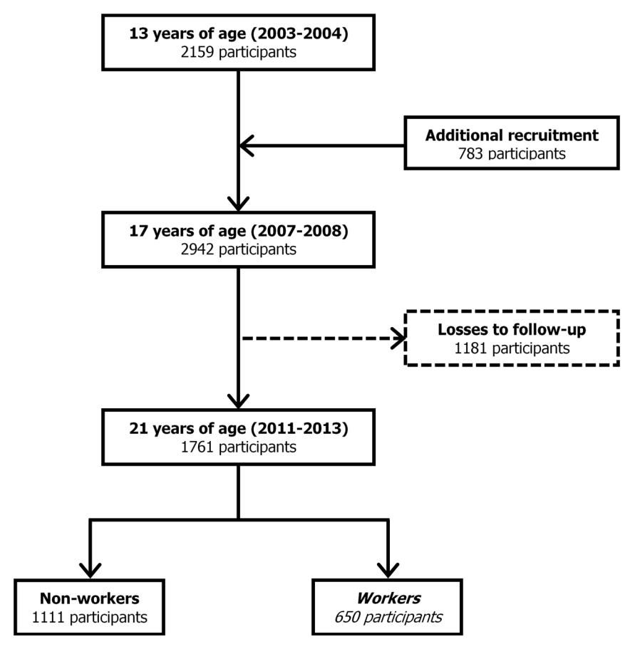
Fig 1. Flowchart illustrating the selection of workers from the EPITeen cohort (n = 650).