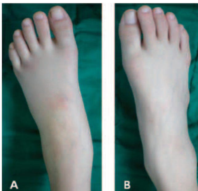
Fig. 1. These picture show swelling of left ankle joint (A) and normal right ankle joint (B).

The present patient developed asymmetric arthritis, balanitis,