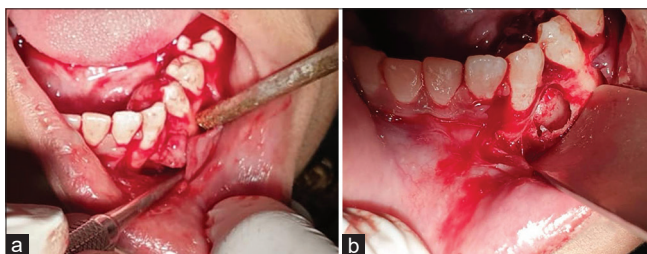
Figure 3: (a and b) Surgical enucleation of lateral periodontal cyst