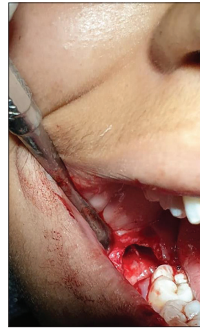
Figure 2: Surgical enucleation of the odontogenic keratocyst

Histologically, OKC is characterized by parakeratinized stratified squamous epithelium which is 5–8 layers in thickness. Basal cell layer has columnar cells with palisading arrangement of nuclei with polarization described as tombstone/picket fence appearance. Satellite cysts are present in the capsule. Lumen may be filled with a thin straw-colored fluid/thick creamy