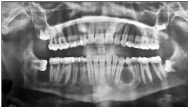
Figure 1: OPG revealing odontogenic keratocyst in the right mandible and lateral periodontal cyst in the left mandible