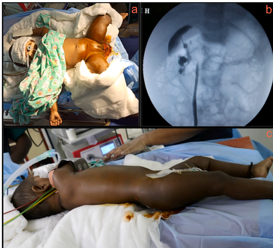
Fig. 2. (a) Lithotomy position for ureteroscopy (b) Retrograde Pyelogram showing contrast extravasation in upper calyx (c) Modified supine position for PCNL.

>20 mm renal stone. For 10–20 mm renal stones all the three are options.