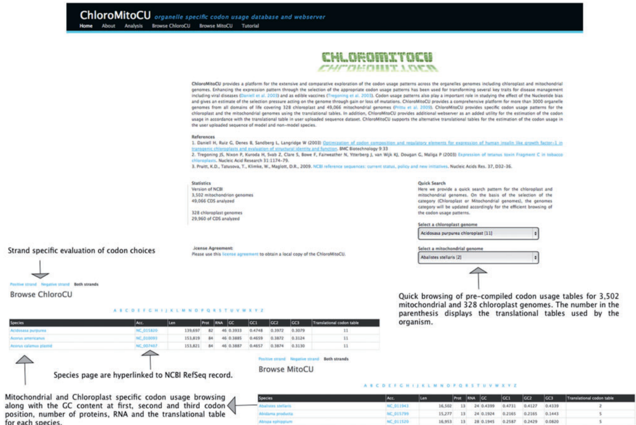
Figure 1. The efficient browsing system of ChloroMitoCU.

of tRNAs, and the usage patterns and relative frequencies of codons (Fig. 1). Figure 1 shows the user-friendly interface of ChloroMitoCU, which offers a two-way search for browsing chloroplast-specific codon usage patterns (Browse ChloroCU) and mitochondria-specific codon usage patterns (Browse MitoCU). In addition, a dropdown menu provides the alphabetically sorted list of the chloroplast and mitochondrial genomes with associated translational codes. Lastly, all of the alphabets in the quick-search forms are hyperlinked to the corresponding codon usage-pattern page of the selected species.