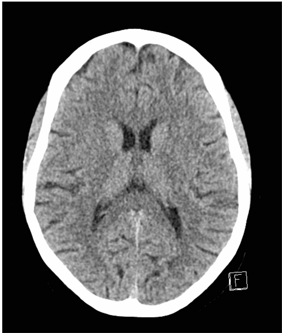
FIGURE 1: Computerized tomography (CT) scan of the brain in the axial view in a comparable view to the MRIs in Figure 2 and Figure 3, showing no acute abnormality.

On hospital day 1, her encephalopathy continued, and she underwent a lumbar puncture with no evidence of infection. Human immunodeficiency virus (HIV) and rapid plasma reagin (RPR) testing were negative. On hospital day 2, the patient gradually became more alert and was found to have severe sustained conjugate vertical nystagmus, superimposed on severe disconjugate horizontal gaze with severe end gaze nystagmus. MRI of the brain with and without contrast showed increased T2 signal with restricted diffusion in the medial thalami bilaterally, surrounding the third ventricle, and in the periaqueductal gray matter, consistent with WE (Figure 2). She was started on high-dose thiamine, folate, and multivitamin. With treatment, her encephalopathy, nystagmus, and weakness improved. She was discharged to a rehabilitation facility with lifelong vitamin supplementation and off all psychotropic medications until psychiatry follow-up, given the concern for malabsorption due to her gastroparesis. Seven months from the initial presentation, the patient continues to recover with increasing mobility, resolving nystagmus, and an improving MRI (Figure 3).