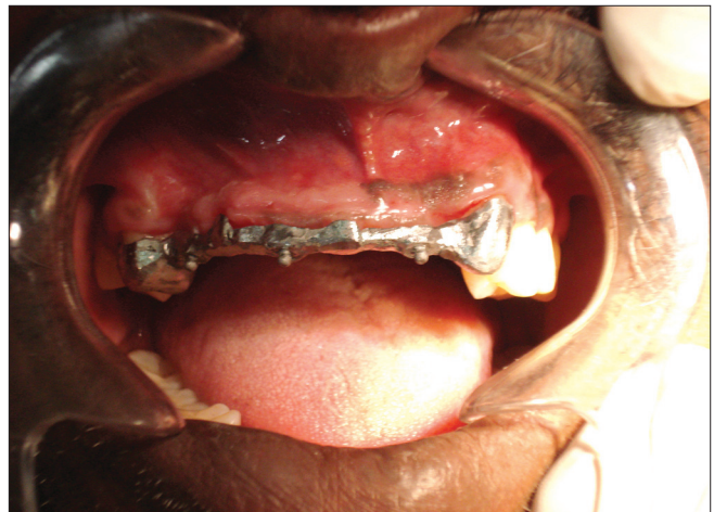
Figure 4: Framework try in