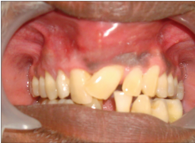
Figure 1: Preoperative intraoral view