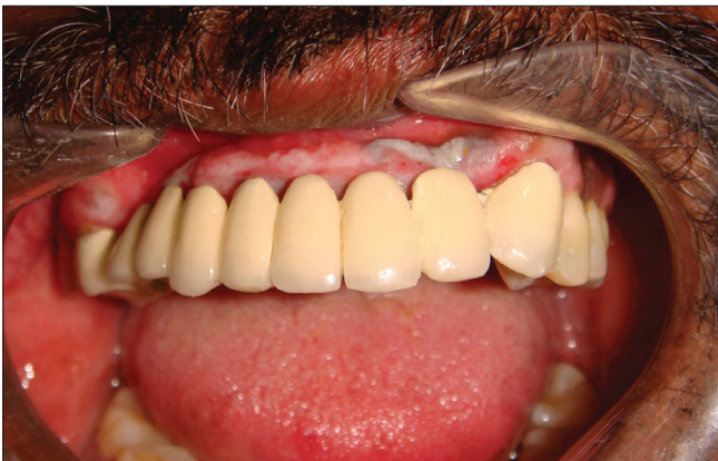
Figure 5: Final prosthesis in the patient

putty, light body impression, was made and poured in die stone (Ultrarock, Kalabhai Karson, India).