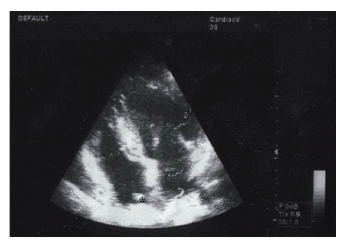
Figure 3: Echocardiogram showed the catheter tip in the upper third of the left atrium (black marker)

Currently, long-term tunneled catheters are used for either hemodialysis or chemotherapy routinely. The catheter tip has been recommended to be placed just at the RA or superior vena cava (SVC-RA) junction or to prevent early (arrhythmia, tricuspid valve damage, cardiac tamponade) or late (thrombosis, infection, and malfunction) complications. Catheter dysfunction or vascular thrombosis