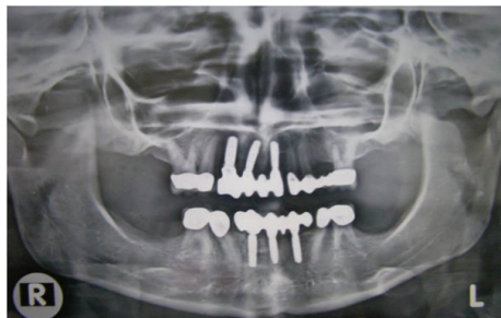
FIGURE 9: Radiograph taken after 6 months of cementation of the prosthesis.

increasingly difficult due to growth of the mandible and deficient height of the alveolar processes [6]. In the mandible, the transverse skeletal or alveolodental changes are less dramatic as in the maxilla. The insertion of dental implants in children or adolescents before completion of craniofacial growth is said to have imitated the effects of ankylosed teeth [7]. When placed in alignment with adjacent teeth, the implants did not participate in growth processes, resulting in an infraocclusion and multidimensional dislocation when compared with the developing teeth. The adjacent tooth germs exhibited morphologic changes and disorders of eruption [8]. The insertion of implants in the growing maxilla should be avoided until early adulthood as fixed implant constructions crossing the midpalatal suture will result in lack of growth [9]. In the nearly anodontic child, however, these problems can be neglected [10].