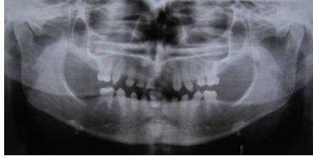
FIGURE 1: Preoperative radiograph showing overretained deciduous teeth and a few permanent teeth.