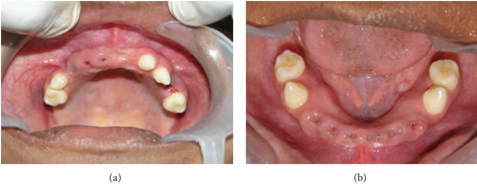
FIGURE 4: Maxillary and mandibular arch after extraction of mobile deciduous teeth.