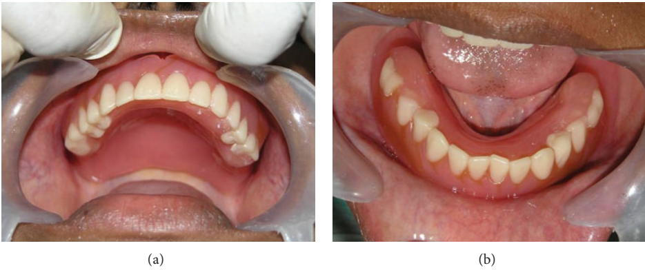
FIGURE 5: Conventional overdenture prosthesis inserted in the patient's mouth.