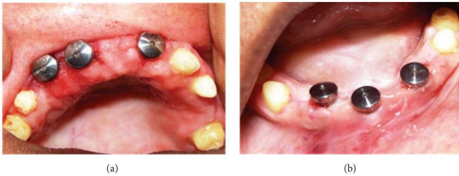
FIGURE 7: Implants in maxillary (12, 13, and 21 regions) (a) and mandibular (41, 43, and 32 regions) (b) with attached gingival formers.