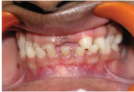
FIGURE 2: Severely attrited mixed dentition resulting in a collapsed bite.

overretention of deciduous teeth, alterations of teeth shape, and missing permanent tooth buds for most of the teeth [3].