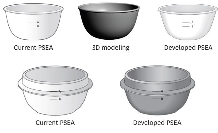
Fig. 1. Redesigning of 2D PSEAs (rice bowl and earthen pots). 2D, 2-dimensional; PSEA, portion size estimation aids; 3D, 3-dimensional.

General characteristics of the participants are presented in Table 4 . The participants consisted of 48 (50%) males and 48 (50%) females. The average age was 46.6 years without significant difference between the groups. Regarding education level, most participants (41.7%) were high school graduates, and the percentage of housekeepers (26.0%) was the highest among occupations without any significant differences between the groups.