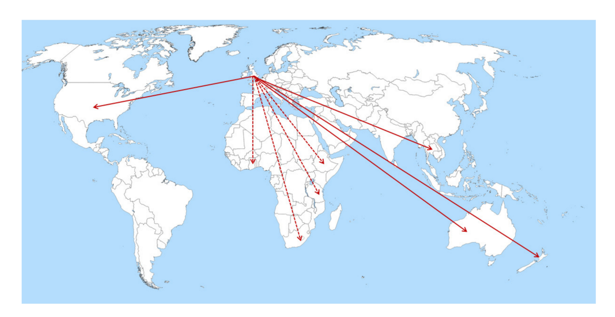
Figure 3. World map displaying the origin of Parkinson's Disease Nurse Specialists in the UK, with subsequent adoption of a PDNS service globally, including Australia, Thailand [57] and the USA (solid lines). UK-led training programmes have additionally helped to disseminate skills and information to several countries in Africa (dotted lines).

Training PDNSs has the potential to have a significant impact on the care of people with PD in Sub-Saharan Africa, especially given the lack of doctors with movement disorder-specific expertise in these countries [51]. Dotchin et al. described the crucial role of the PDNS in overseeing the up-titration of levodopa in the Tanzanian PD cohort, particularly when initiating medication late in the disease course [58]. Qualitative research undertaken in Tanzania, has demonstrated the lack of awareness around PD and the deeply held views surrounding symptoms, which individuals attribute to witchcraft, a curse or an expected part of the ageing process [59]. This highlights an important role for the PDNS in educating patients, caregivers and the wider community, as well as dispelling cultural-specific myths around the disease. As a result of this pioneering work, participants from more than 20 countries have attended training and have been linked with a UK PDNS mentor and there are ambitions for a network of neurology nurses in Africa. These successful face-to-face training programmes and previous use of tele-education for PD training in Cameroon [60] provide a model with which to facilitate dissemination of the PDNS role to other low-income countries.