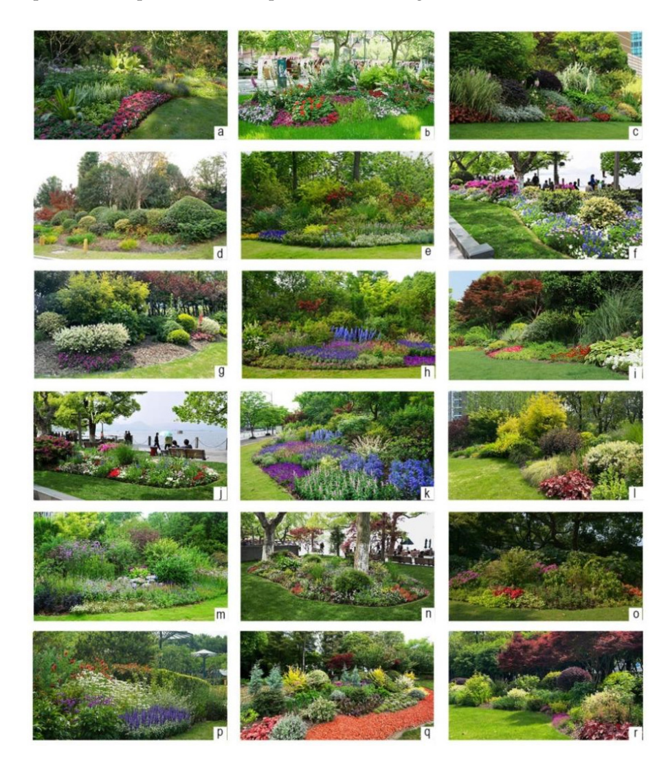
Figure 1. Representative scenes of flower borders used as visual stimuli in this study; ( a – r ) are the 18 images for this study.

Photographic images were used as surrogates for real flower border landscapes in this study as the effectiveness of this method has been widely confirmed [31,37,38]. A total of 70 images of flower borders in urban green space were taken by one of the authors using a Sony Alpha 7R II digital camera between the hours of 10.00 a.m. and 2.30 p.m. on clear days. All images were transformed to a 3936 \times 2214 px resolution using the Adobe Photoshop CS6 software. The photographs were not further digitally modified. To fulfill the objectives of this study, from all photographs, 18 final images that are the most representative scenes of flower borders were selected for evaluation according to the opinions of experts on landscape architecture (Figure 1) [37].