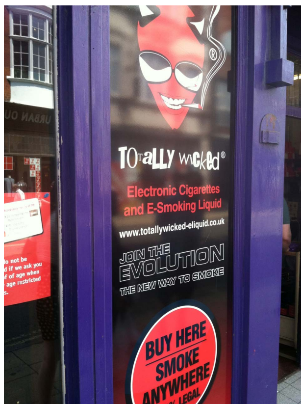
Figure 2 An example of an exterior e-cigarette advertisement.