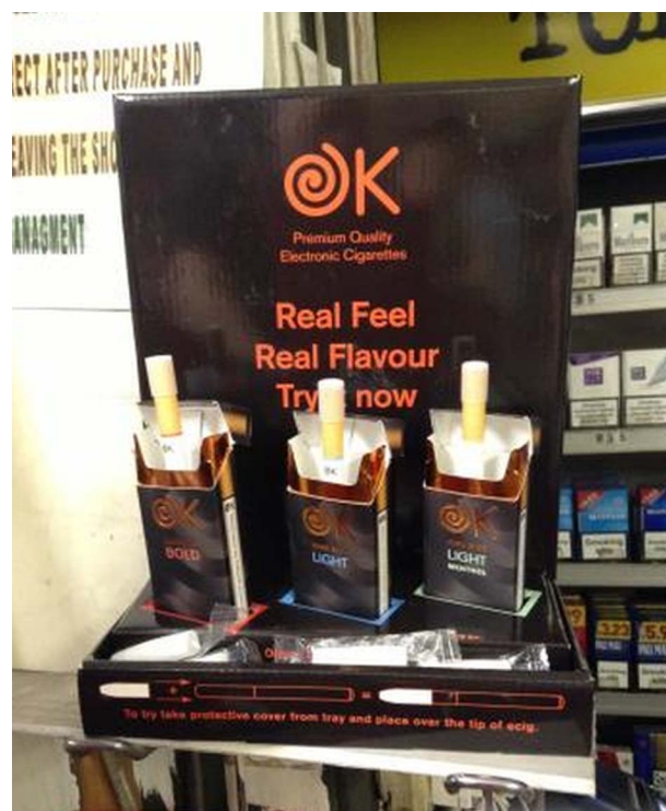
Figure 1 Point-of-sale movable display that invites store customers to sample the e-cigarette by providing disposable plastic covers to put over the tip.

Our audit tool included dichotomous measures for whether stores sold e-cigarettes, promoted them with