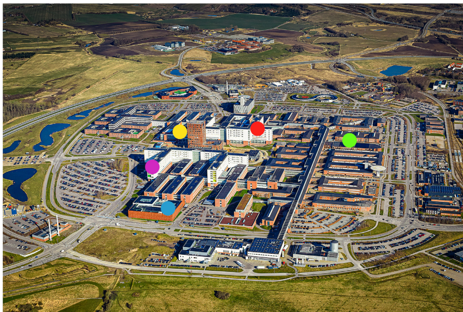
Figure 1 Aarhus University Hospital. Blue: Danish center for Particle therapy. Purple: Department of Radiology, Section of Abdominal and Oncoradiology. Yellow: Department of Nuclear Medicine and PET-Centre. Red: Department of Radiology, Section of Neuroradiology. Green: Department of Radiology, Section of Thoracic, Female and Pediatric Radiology.

entire country with proton radiotherapy, and therefore patients are referred nationwide. Our hospital is among the biggest in Europe and houses 44 departments and a total of 1,150 beds. The hospital area covers 500,000 m 2 and the walking distance from the most distant part of the Department of Radiology (Section of Neuroradiology) and the Department of Nuclear Medicine & PET-Centre to the DCPT is around 15 minutes (Fig. 1). From the planning phase of the DCPT, it was a clear aim to maintain a high quality in target delineation, despite the logistic challenges outlined above. In addition, we experienced a need for more frequent target delineation conferences in order to reduce planning time for new patients, as patients most often start their treatment trajectory at the local departments of oncology, and from there, they are referred to the DCPT, if proton therapy is considered beneficial.