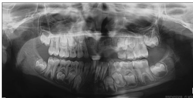
Figure 1: Panoramic radiograph showing ghost teeth in relation to 11, 21, 22, and 23