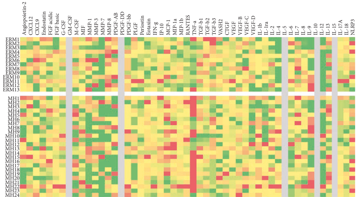
FIGURE 3: Visualization of the intergroup differences using a heat map chart for all 52 cytokines. Red indicates high expression and green indicates low expression. GM-CSF, PDGF-DD, IL-5, IL-10, and IL-15 in vitreous are too low to be detected (grey).

Before our CONCEPT trial, we thoroughly retrieved the published literature on vitreous cytokines during the last decade. Considering the compatibility of different cytokines in a single commercial bead array, we finally investigated 48 cytokines using the multiplex bead array method and the other 4 cytokines with ELISA. Here, a total of 52 cytokines were included in the present study, covering most of the published factors associated with intraocular diseases and some new cytokines in other related diseases, such as asthma and Alzheimer's disease. And these cytokines can be classified into four main groups: the inflammatory factors and chemokines, the promoting angiogenesis factors, and the fibrogenic cytokines, which corresponding, respectively, to inflammatory, neovascular, and fibrotic retinopathy. Among those cytokines, the frequently reported cytokines such as TNF-\alpha [25], IL-6 [7, 26], and TGF-\beta [27] were compared between our study and proliferative diabetic retinopathy, and the expressions of the three cytokines in proliferative diabetic retinopathy were found times higher as compared with those in MH/ERM.